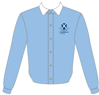
Long sleeved blue chambray shirt with white collar (girls)