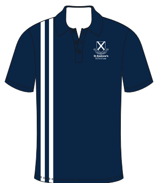
Navy polo shirt (preferred for PE)

Students are expected to wear their PE uniform on days when PE lessons are scheduled. The PE uniform should not be worn as part of the formal or casual uniform. See page 9 for footwear and accessories.