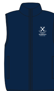
Navy fleecy vest