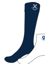
Long or short navy socks (shorts) Short white socks (dress)