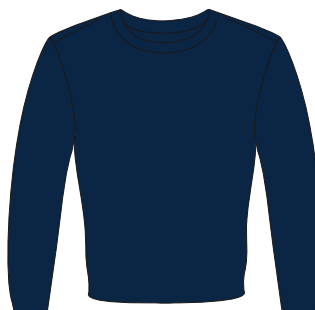
Navy long sleeve top