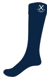
Long navy socks or navy stockings