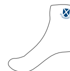
1/4 sport socks