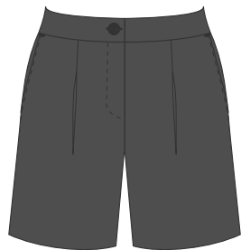
Unisex shorts with adjustable waist*