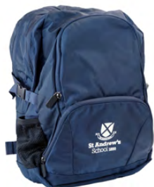
ELC Backpack ELC only (optional)