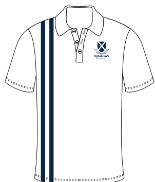
White polo shirt (cricket, tennis and PE)