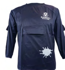
Art smock (compulsory for Reception – Year 2)