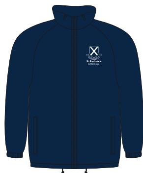
ELC rain jacket