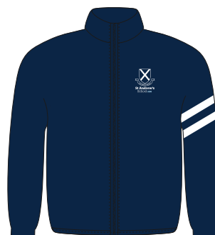
Navy tracksuit top