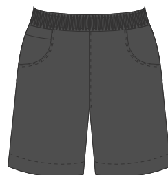
ELC elastic waist shorts*