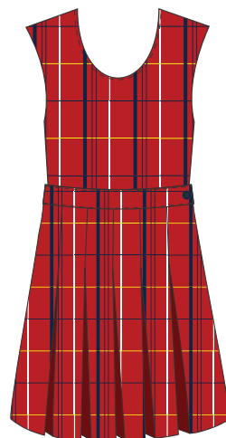
Pinafore (Junior Primary)