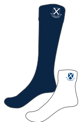
Long or short navy socks with shorts