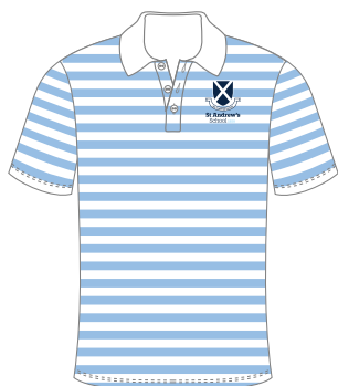
Striped polo shirt

All pieces of the Early Learning Centre uniform can be interchanged for wearing in summer and winter, allowing comfort in all weather conditions. See page 9 for footwear and accessories.