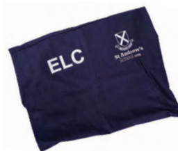
ELC pillow and pillowcase