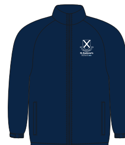
Soft shell jacket