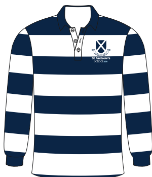
Striped rugby top