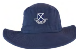
Wide brimmed hat