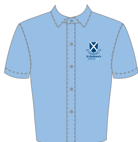
Unisex short sleeved blue chambray shirt