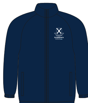
Soft shell jacket