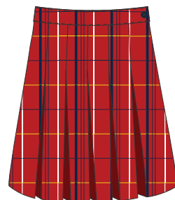
Pinafore - bib removed (Upper Primary)