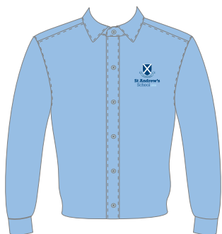
Long sleeved blue chambray shirt (boys)

Students in Reception to Year 6 are required to wear formal uniform, including their blazer, to Church and Assembly all year. Formal school uniform and blazers are to be worn to all excursions. See page 9 for footwear and accessories.