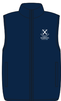
Navy fleecy vest